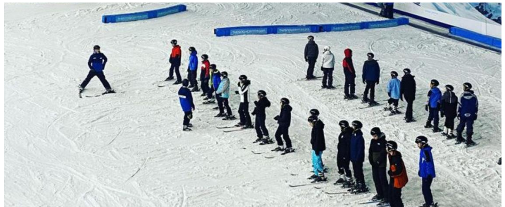
Image above: RHS students prepare for their ski lesson at The Snow Centre