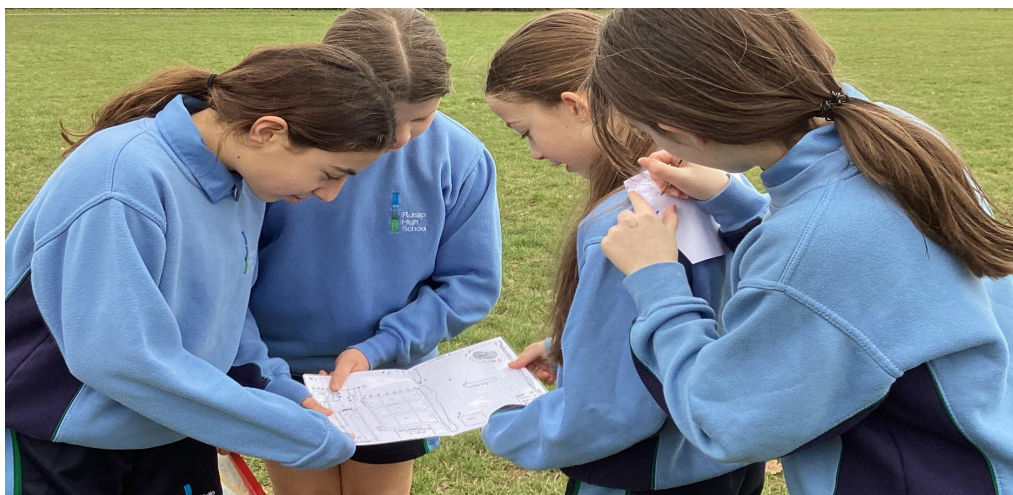
Image above: Year 7 students get stuck into their orienteering lesson

This half term in PE Year 7, 8 and 9 students have been doing dance, gymnastics and outdoor adventurous activities (OAA).