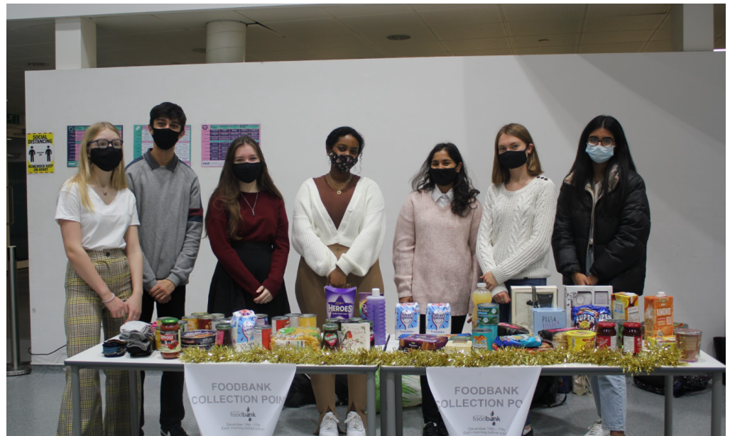
Image above: The Sixth Form Student Leadership Team stood with the foodbank collection stall.

At the end of the Autumn Term, our school's Student Leadership Team held a collection for the Hillingdon Foodbank, which is run by the Trussell Trust. Students from across the school brought in donations of tinned food, dried foods, and toys. In total, the collection received over 100kg of donations, which helped to make the Christmas period that bit more enjoyable for some of the most vulnerable members of our local community.