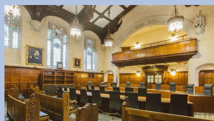
The Supreme Court