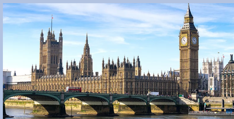
The Houses of Parliament